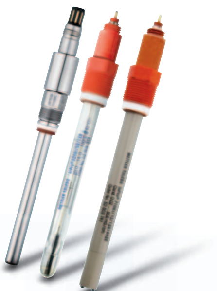
InPro 6860i DO, InPro 3250i pH and InPro 7100i conductivity sensors

The chemical used in CIP is often sodium hydroxide, which is stored in high concentrations to save transportation costs and storage space, and is later diluted. Sodium hydroxide concentration in CIP cycles is around 2 to 5%. Dilution needs to be determined with sufficient accuracy to ensure solution concentration