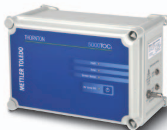
Total Organic Carbon Sensor 5000TOC i