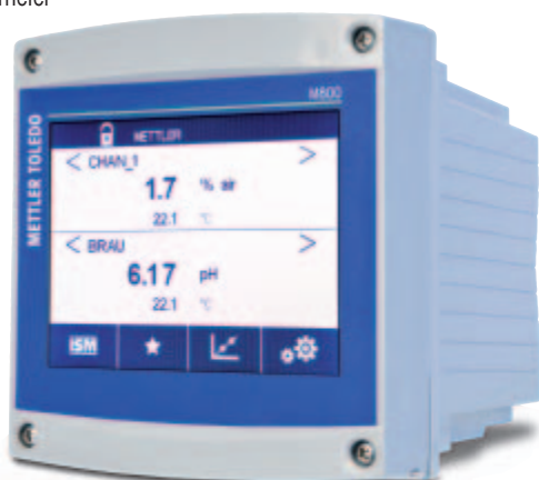
M800 multi-parameter transmitter

The quality of Pure Steam is difficult to assess in its vapor state; therefore, the attributes of its condensate are used to indirectly test its quality. The parameters that must be tested are the same as those for WFI, i.e. bacterial endotoxins, TOC, and conductivity. METTLER TOLEDO ISM conductivity and TOC sensors help a facility ensure the quality of Pure Steam is always within specifications and therefore is compliant with pharmacopeia regulations. Predictive diagnostics provide advance notification of maintenance, eradicating unplanned downtime due to sensor failure.